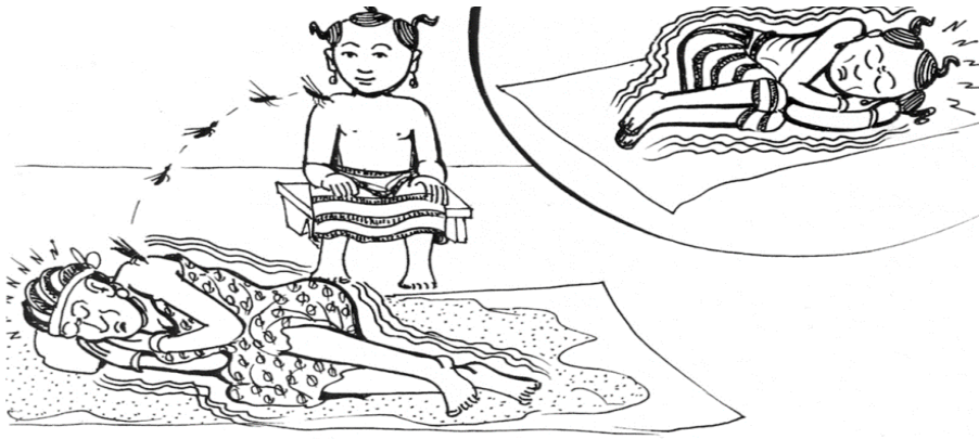
Figure 1: The malaria cycle [1]

Malaria can also be transmitted from mother to fetus.